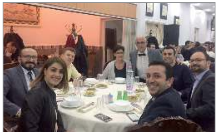
Figure 19: Gala Dinner