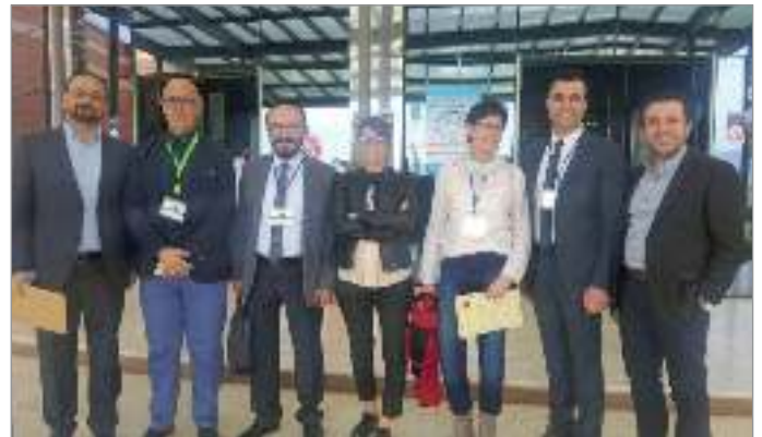
Figure 3: Course Team