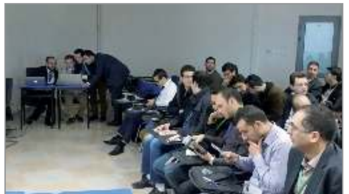
Figure 13: Video lectures