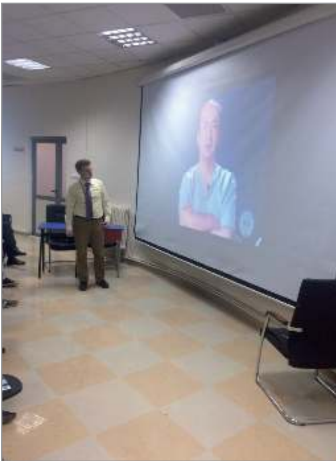
Figure 11: Laparoscopic training models