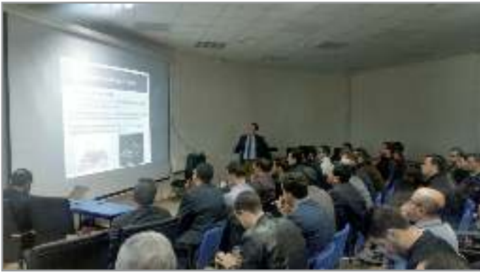
Figure 9: Access techniques