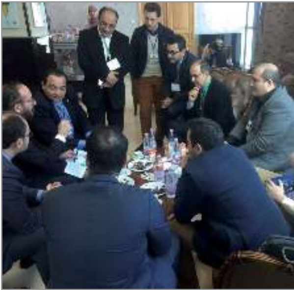
Figure 14: Tunisian Urology Association