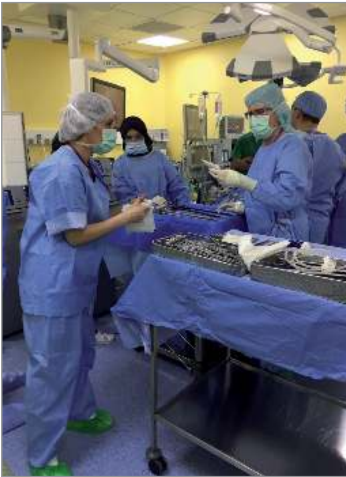
Figure 5: Nurses in Operating room

In addition, Prof. Özgök gave “Step by Step robotic radical prostatectomy” and “International experience of laparoscopy training” presentation in 1st International Laparoscopy ACELAS symposium.