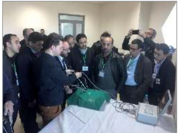
Figure 12: Hands on training