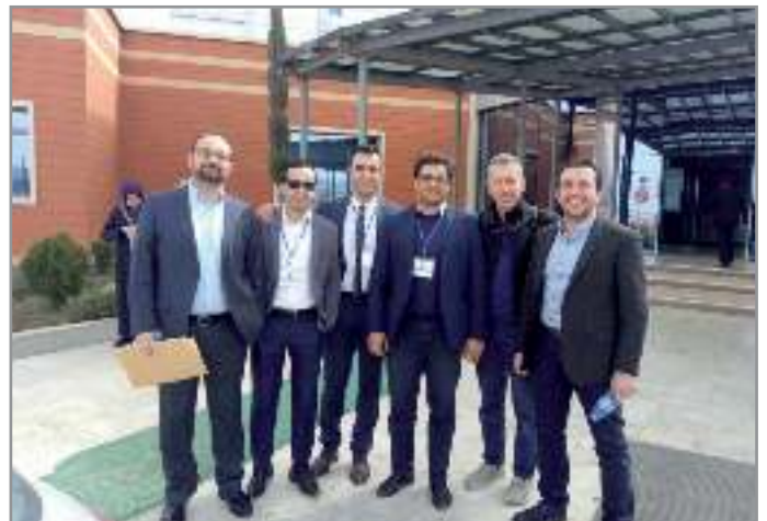
Figure 17: Trainees and trainers