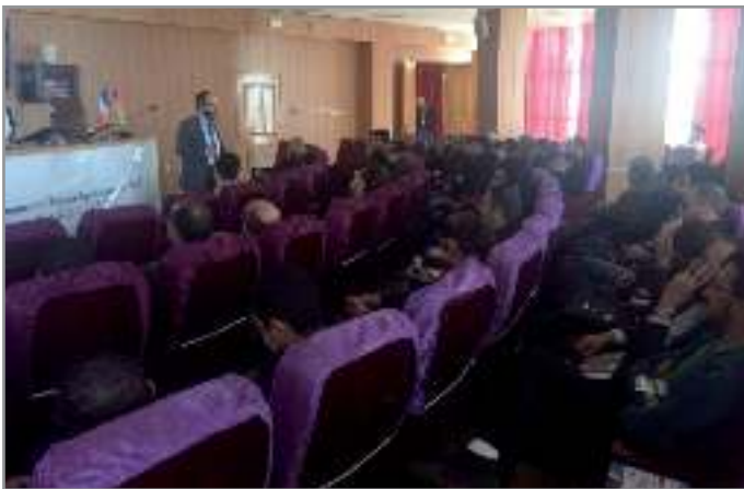
Figure 16: Step by Step Robotic radical prostatectomy in ACELAS symposium