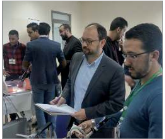
Figure 15: Basic laparoscopy exam on training boxes