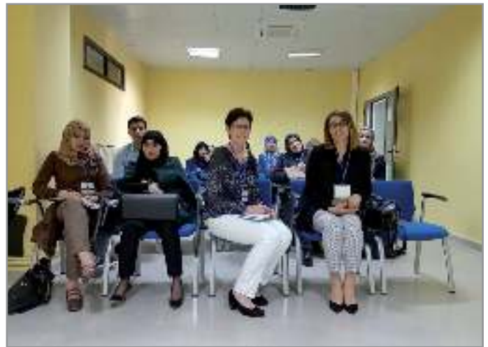
Figure 6: Theoretical lectures of Nurses

A farewell dinner with inclusion of the whole team was organized at the end of the first day of the course. After the end of the course, the towns of Timgad and Setif were visited. In summary, a very efficient laparoscopy course was performed.