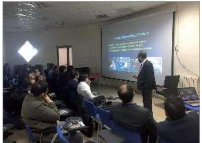
Figure 7: Training in Laparoscopic urology