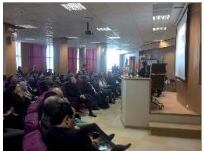
Figure 4: 1 st International Laparoscopy workshop on urology ACELAS symposium