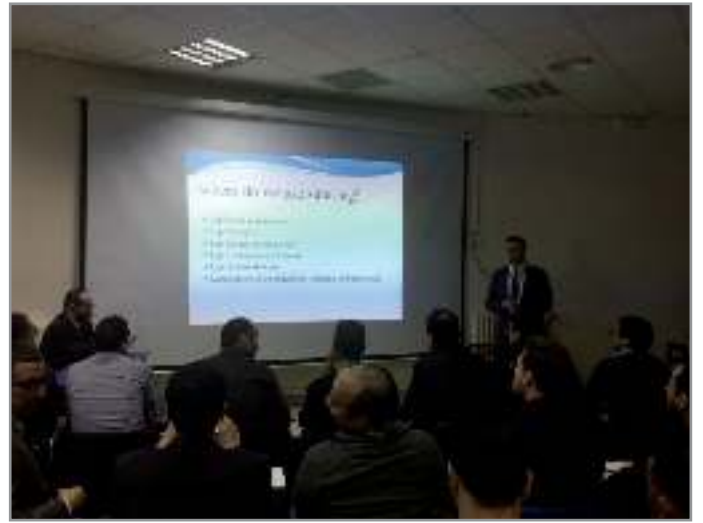
Figure 10: Laparoscopic suturing techniques