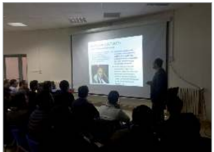
Figure 8: Urologic Laparoscopic equipment