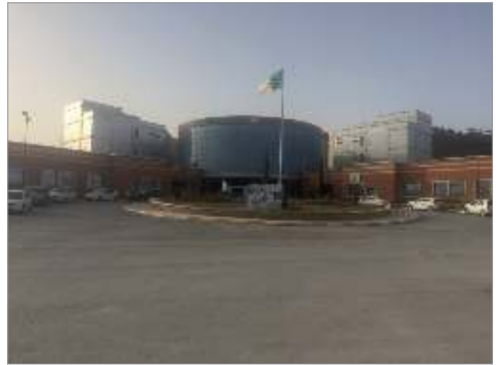
Figure 2: Oncological Surgery Center/ Batna-Algeria