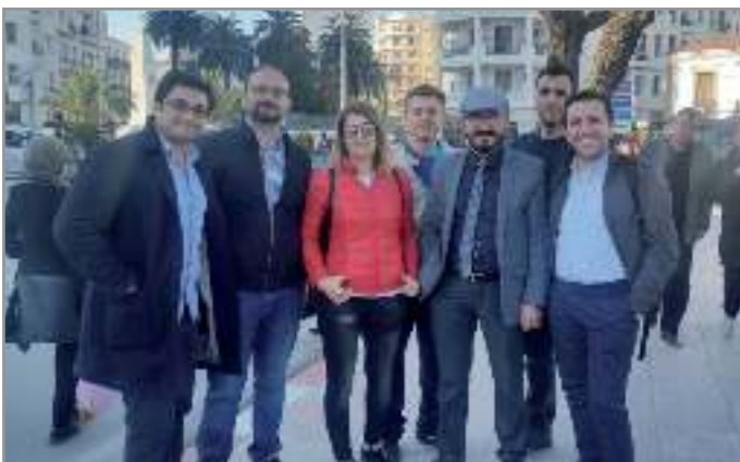
Figure 18: Constantine/ Algeria